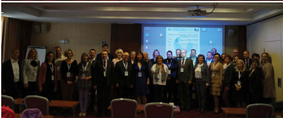
Figures 6, 7. Participants of the DLCC2018 conference and the EU IRNet project.